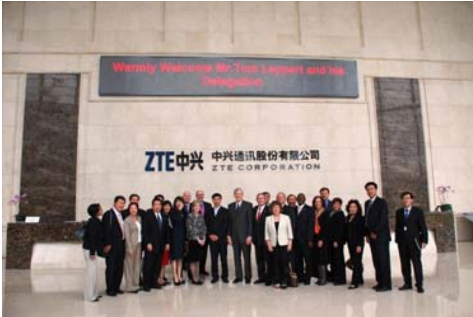
Delegation photo at ZTE Headquarters