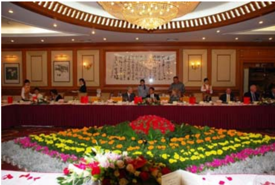
Mayor Leppert, Mayor Xi at banquet for the delegation. Now that's a centerpiece!