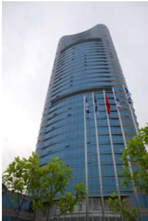
ZTE World Headquarters, Shenzhen, China