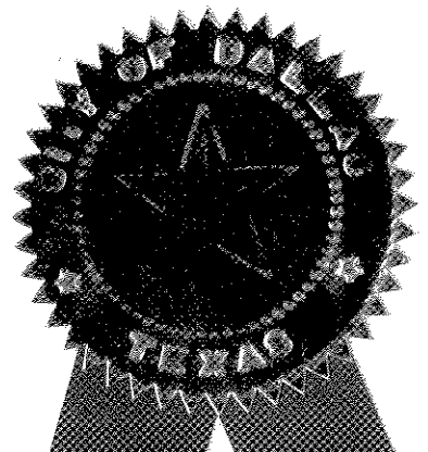
Mayor, The City of Dallas