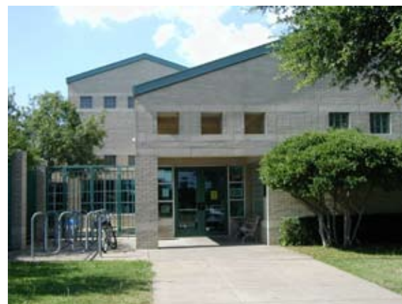
With regular access to students through their developmental years, schools are a great community resource for conducting early crime prevention.