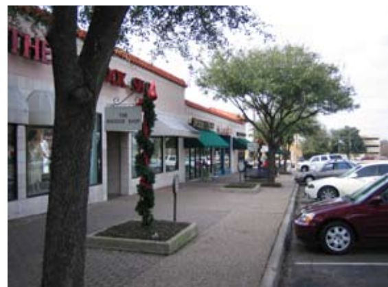
Neighborhood-serving retail adds to the walkability and quality of life in a neighborhood.