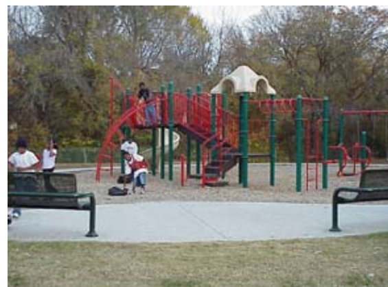
Neighborhood parks provide family recreation areas close to home.