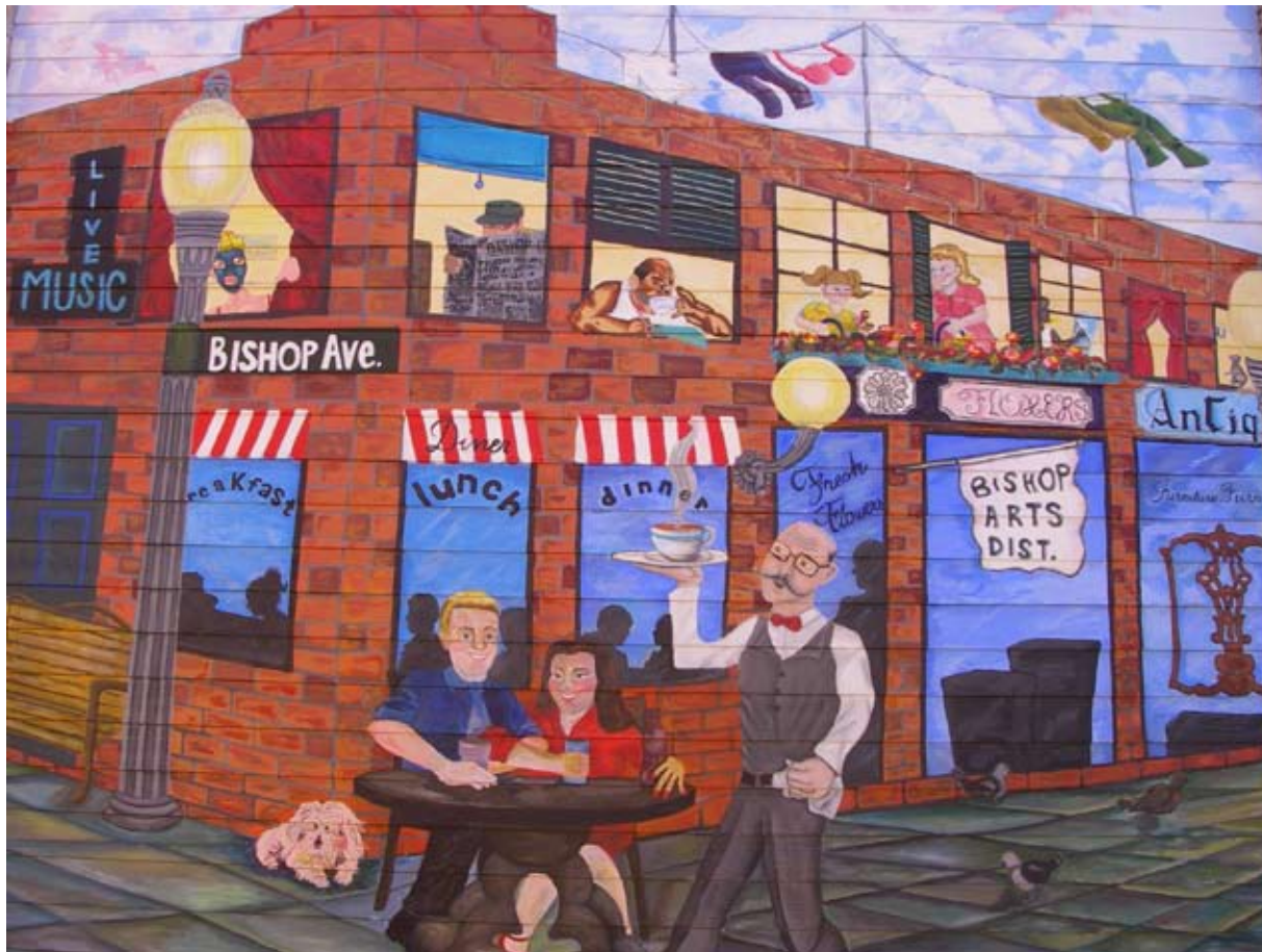
The Bishop Arts District mural adds color and character and helps define the areas's sense of place.