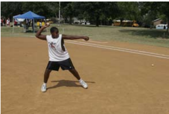
Access to parks, playgrounds, ball fields, natural areas, transit service, commercial districts and other civic amenities should be available within walking distance of all neighborhoods.